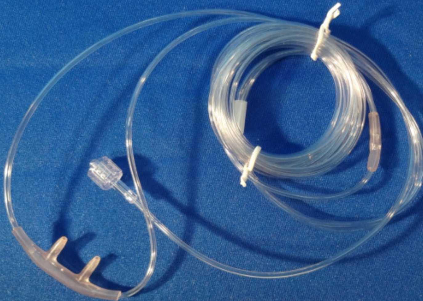
Nasal Cannula 7 Ft # 4000