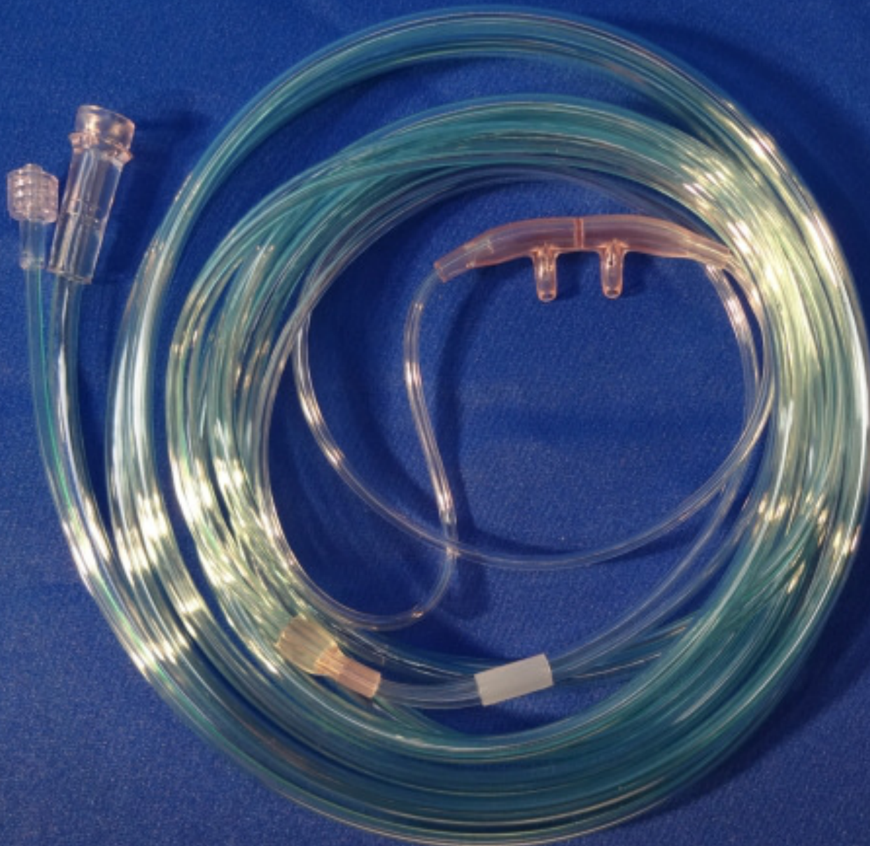
Divided Nasal Cannula 10 Ft # SO 443